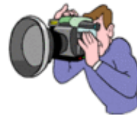
Photo sessions will be held at Hunt's by LifeTouch representatives on Friday (2-9pm) and Saturday (10am-5pm), Nov. 18 th & 19 th and 25 th & 26 th .

It's Time for a New Pictorial Directory!